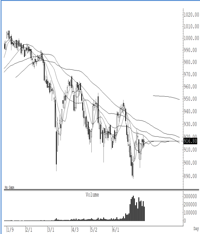
S50U23 (Close 916.80 Chg 3.40)